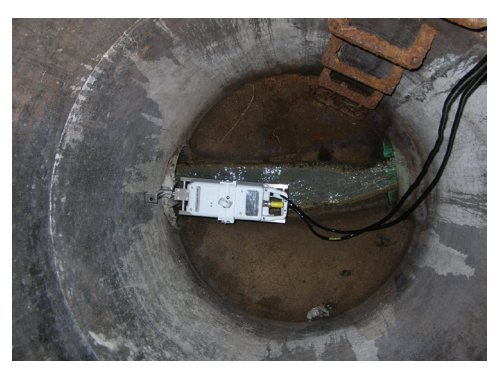
DDS Flo-Dar Sensor installed in a manhole