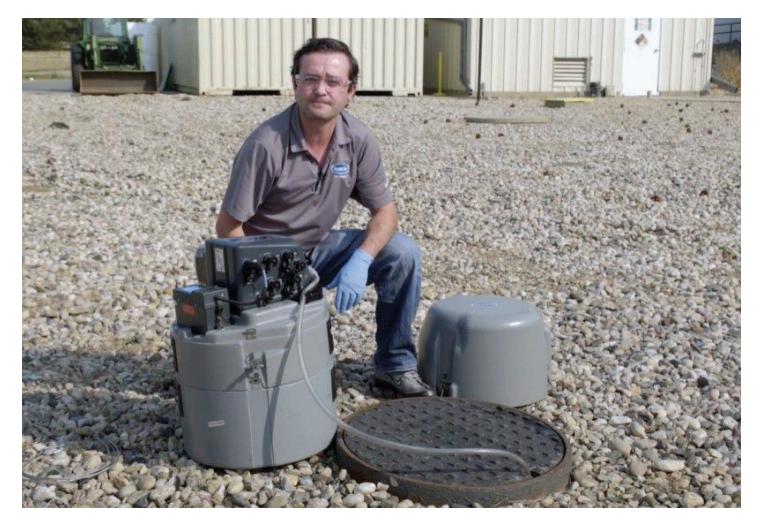
Figure 2. Automatic sampling is a cost-saving, labor-saving way to enable thorough data collection with minimal disruption to wastewater utility work schedules and budgets. This instructional video describes how proper sampler design and implementation can pay dividends in epidemiological and environmental testing applications.