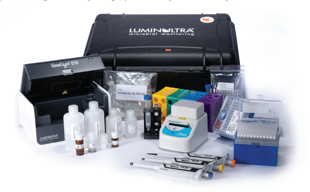
Figure 4. Comprehensive kits that include everything needed to start—a qPCR instrument, pipettes and necessary labware, heating block, and SARS-CoV-2 assay with reagents—make it easy for current wastewater lab technicians to deliver new insights on a community's exposure to COVID-19 from the first day of testing.