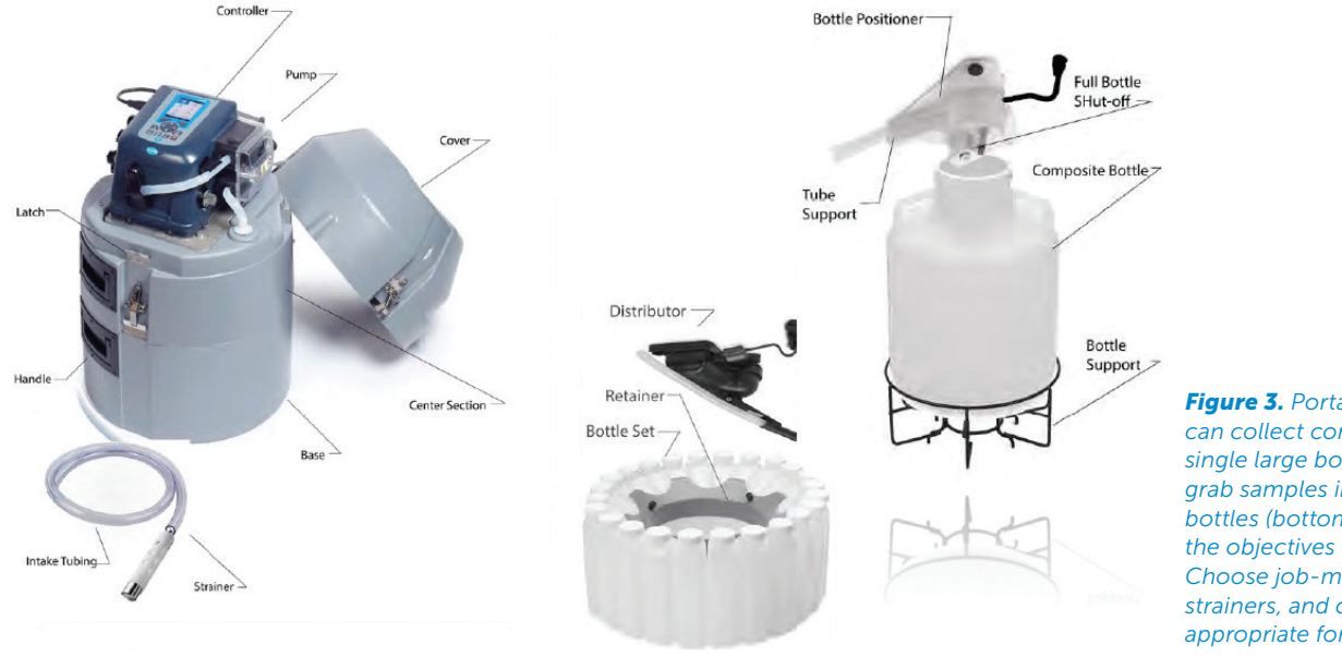
Figure 3. Portable automatic samplers can collect composite samples in a single large bottle (far right) or individual grab samples in a series of separate bottles (bottom center), depending on the objectives of the testing program. Choose job-matched sampling tubes, strainers, and control options appropriate for the task at hand.