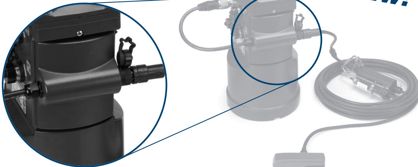
AV9000 Analyzer Module shown with Sub AV Sensor and Wireless FL904 Flow Logger. Sensor, analyzer module and logger are ordered separately.