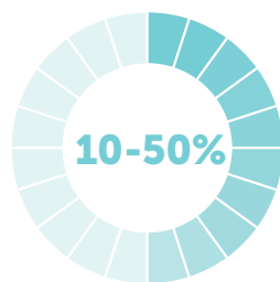
Projected Energy Savings*