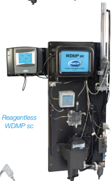
Reagentless WDMP sc