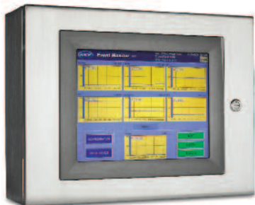
Event Monitor™ Trigger System