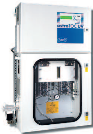
astroTOC UV TOC Analyzer

The astroTOC Analyzer is one of Hach's most sophisticated water quality sensors; it greatly enhances the detection and classification capabilities of the Event Monitor Trigger System. When combined with the Water Panel, the TOC Analyzer exponentially increases the system's sensitivity to organic chemicals, resulting in a unique early warning system that is one of the most innovative in the industry.