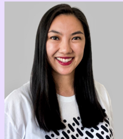
Submitted by: Stephanie Yu

Tip: "Automating the tedious and repetitive aspects of writing Boolean strings can be a huge time saver and efficiency booster. It simplifies the construction of complex strings, reduces risk of errors, and ensures all relevant terms and phrases are included. Plus, it can provide keyword suggestions, filtering and sorting options, and reusable search strings. This frees up valuable time and energy for you to focus on evaluating candidates and building relationships."