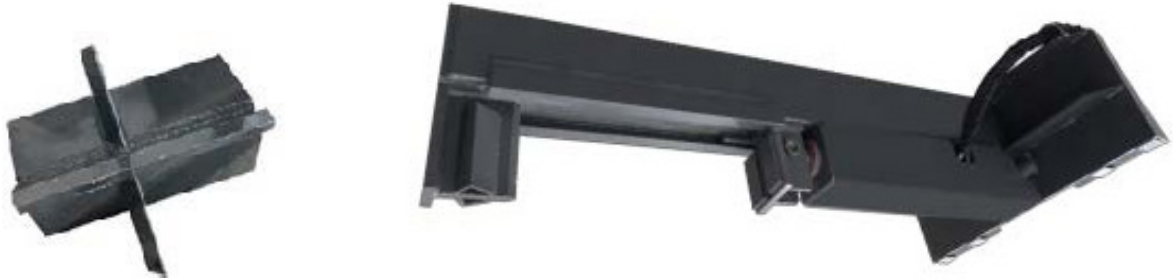
Optional 4 Way Head