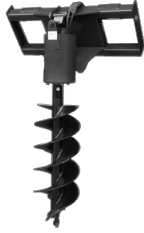
Heavy Duty Auger Drive