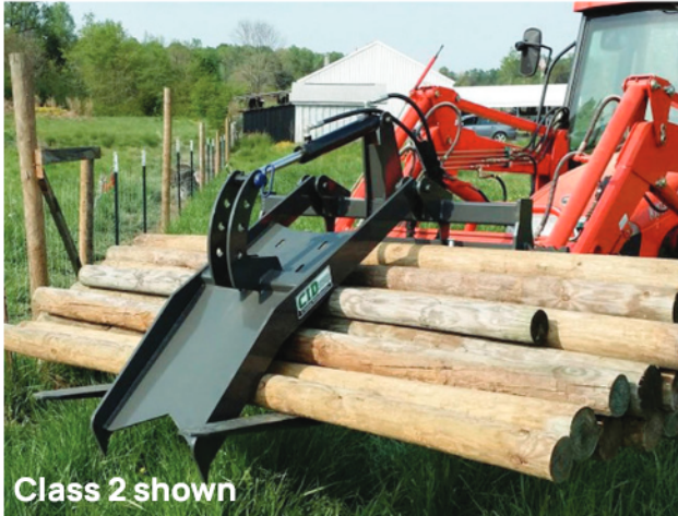
Class 2 shown

Our Fork Grapple is ideal for use on the farm, in logging operations and by general contractors. The top tine is adjustable for small or large loads and the hydraulic cylinder gives you plenty of clamping force. Our fork tines are completely heat treated from the tip to the heel.