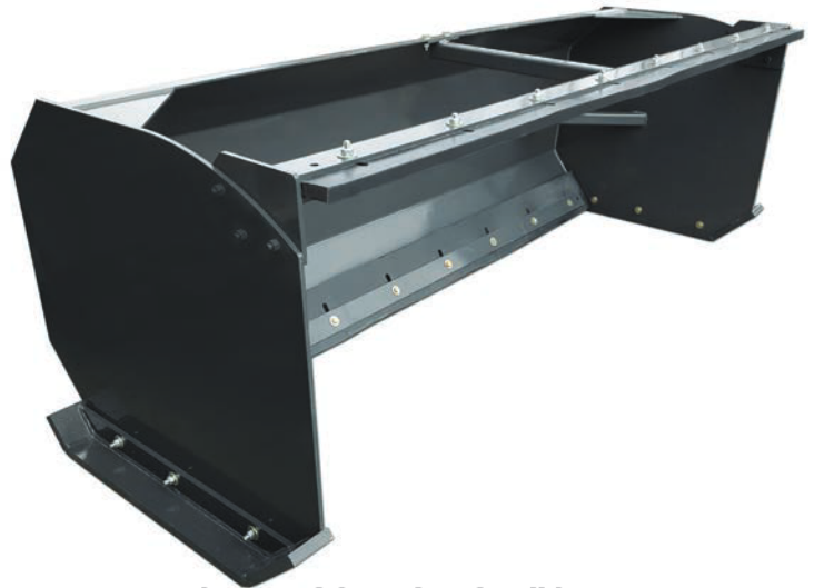
*Shown with optional pull back.

Our X-treme Snow Pusher allows you to clear a parking lot quicker than a snow plow. The snow pusher edge is 1-1/2" thick x 8" wide, adjustable, reversible and replaceable rubber so you won't tear up the pavement. The mold board is 1/4" and the sides are 3/8" thick for extra support.