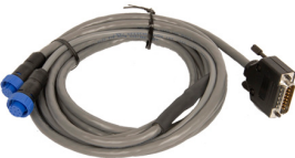
Cable Assembly for 2X, DSR and DUAL 155-2253-00