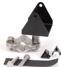
Universal Ka-Band Antenna Mount 200-0525-00