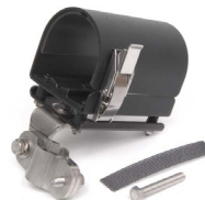
Stalker II Mount 200-0694-00