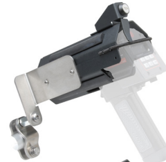
Stalker II Locking Holster 200-0924-00