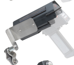
Stalker II Holster 200-0685-00