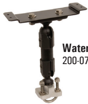
Waterproof Display Mount 200-0739-00