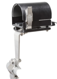
Stalker II Mount with 4" Riser 200-0694-01