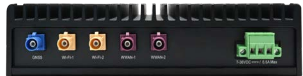
DIGI TX40 5G — BOTTOM