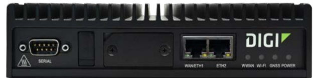
DIGI TX40 5G — FRONT WITH SIM COVER