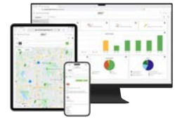
Manage and configure Digi TX40 5G with Digi Remote Manager