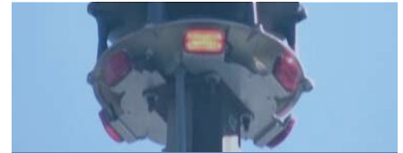
Beacons and Lighting

While tornado sirens have a sound many recognize, it's not always clear to those hearing them to how to prepare, for whatever emergency situation has arisen. PA systems for production line alerts, community evacuations, and police vehicles, can provide specific voice instructions that help guide people to safety.