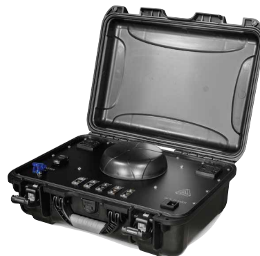
Standard TRaCK Box Unit