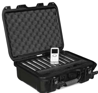
Optional Cell Phone Kit