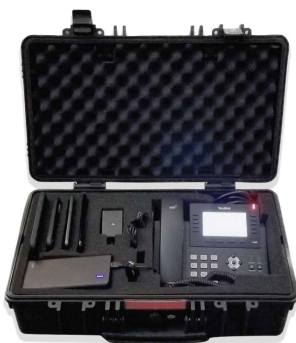
Optional Verizon One Talk Kit