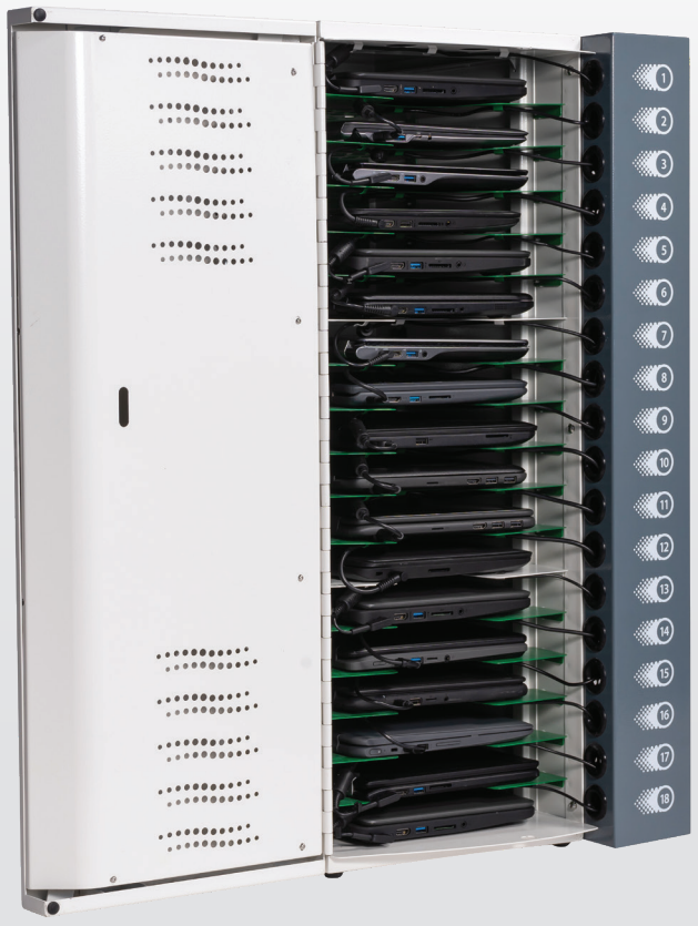
Charging Station Specs: 31" (H) x 16" (W) x 17.9" (D) | 77 lbs