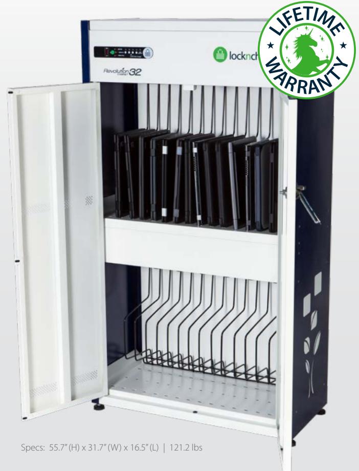
Specs: 55.7" (H) x 31.7" (W) x 16.5" (L) | 121.2 lbs