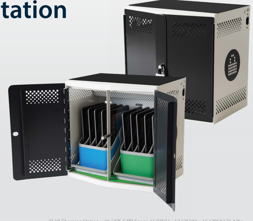
iQ 10 Charging Station with USB-C PD Specs: 15.93" (L) x 12.62" (W) x 16.13" (H) | 31.4 lbs.