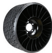
TWEEL® KIT SKU: 79110300