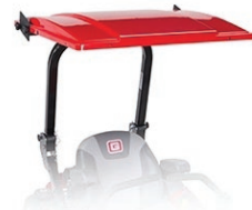
SUNSHADE SKU: 79218000