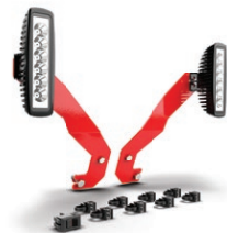
LED HEADLIGHT KIT SKU: 79222900