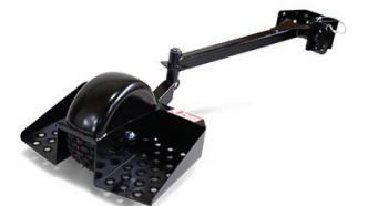
SULKY, SINGLE-WHEEL 18" ARM SKU: 78806800