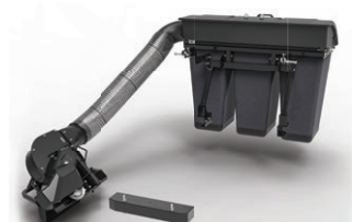
3-BUCKET POWERED BAGGER SKU: 89205500 REQUIRES: Bagger Completion Kit