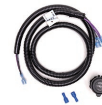
USB PORT ADAPTER KIT SKU: 79111200