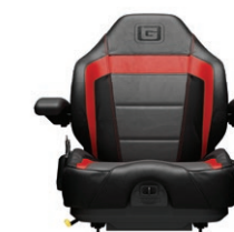
AIR RIDE SEAT SKU: 7922280