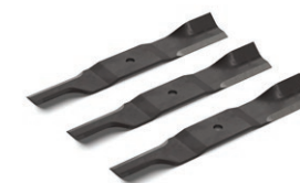
LASEREDGE ® BLADE KIT SKU: 79222400