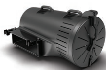
POLY SIDE GRASS CATCHER SKU: 79404800