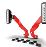
LED HEADLIGHT KIT SKU: 79222900