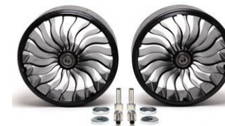
13" FRONT WHEEL CASTER SKU: 79110900