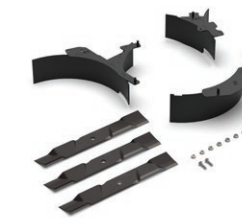
GRASS MULCHING KIT SKU: 79220300 (60"), 79220400 (72")