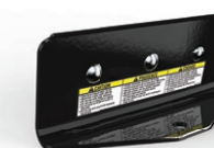
TRAILER HITCH SKU: 79215800