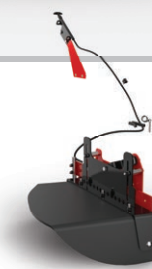
OPERATOR CONTROLLED DISCHARGE BAFFLE SKU: 78807400 (36", 48", 52") 78807500 (60")