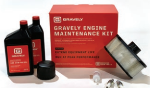
ENGINE MAINTENANCE KIT SKU: 70721700