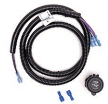
USB PORT ADAPTER KIT SKU: 79111200