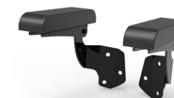
ZERO-TURN ARMREST KIT SKU: 71508400