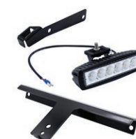
FRONT LED LIGHT KIT SKU: 71517600