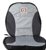
GELCORE SEAT COVER SKU: 71515500