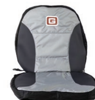
GELCORE SEAT COVER SKU: 71515500