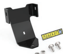
TRAILER HITCH KIT SKU: 71800800