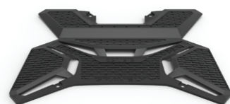
FLOOR MAT SKU: 71801500