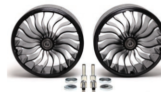
13" FRONT TWEEL CASTER SKU: 79110900