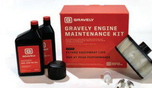
ENGINE MAINTENANCE KIT SKU: 70721700