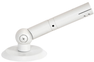
Lazer Line Turnbuckle

PureEdge’s Lazer Line DIY Suspension System is tensioned between walls or ceilings using turnbuckles, allowing it to be positioned at any angle from 0° to 90° relative to the mounting surface. This innovative design creates a striking 3-dimensional effect that seamlessly combines functionality with visual appeal.