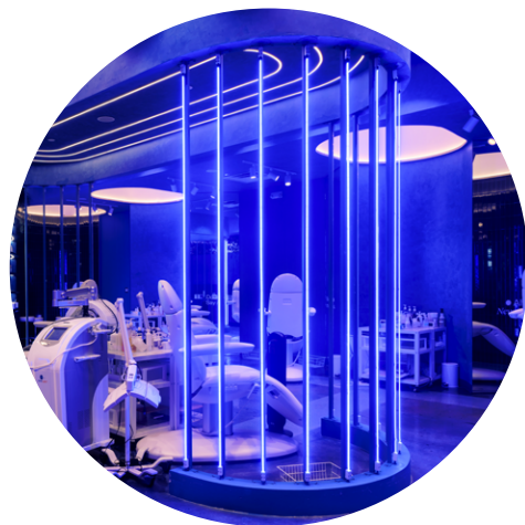
Lazer Line Lens

Lazer Line Lens is a Direct and/or Indirect LED Lighting System that provides general illumination for architectural applications. Slim Turnbuckles and anchors can be mounted wall to wall or ceiling to floor or ceiling to wall. Turnbuckles allow Lazer Line Lens to be positioned 0-90° relative to the mounting surface, creating a 3-dimensional look that is as functional as it is visually interesting. Feed power from one or both ends for longer lengths. Mounts to standard 4" square junction box with round plaster ring. Paint canopy to blend into the surface for a seamless look. Lazer Line Lens is a 0.6" wide stainless steel channel that spans opposing surfaces. The field-cuttable channel allows continual lengths up to 60' with power feeds at each end.