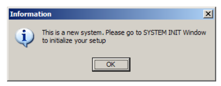
Figure 2. New INI file message

2. If this is a new installation, XC Desktop will display a dialog box indicating this and will inform the user to start at the System Init window.