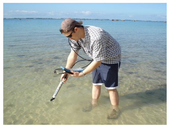
Figure 3. Real-time in vivo phytoplankton measurement using fluorescence sensors on a HYDROLAB sonde

Multiparameter water quality instruments, such as HYDROLAB sondes, utilize integrated submersible fluorescence sensors from Turner Designs for in vivo phytoplankton biomass measurements. Depending on the objectives of the user, these sensors can be deployed for use in spot sampling, vertical profiling, horizontal profiling, and continuous long-term installation applications.