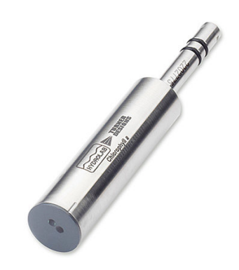
Figure 4. HYDROLAB Chlorophyll a Sensor

the three in vivo phytoplankton fluorescence sensors offered on HYDROLAB sondes, followed by phycocyanin and phycoerythrin. The optics on the in vivo chlorophyll a sensor are specifically aligned with the in vivo fluorescence signature of the chlorophyll a pigment. This optical configuration provides in vivo data that is directly relevant to extracted chlorophyll a measurements, which is important considering that EPA Method 445.0 are specifically based on chlorophyll a pigment concentrations.