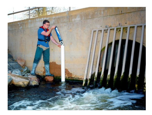
Figure 5. Long-term deployment of HL7

Although spot sampling at one depth can provide a helpful data point at one place and one time, more data points taken over a wider spatial range can provide even more insight. For example, an extended deployment taking continuous readings every 15 minutes can capture daily and seasonal fluctuations of phytoplankton levels, while vertical and horizontal profiling of a water body can capture phytoplankton biomass that may be missed during spot sampling due to inherent patchiness in phytoplankton distribution.