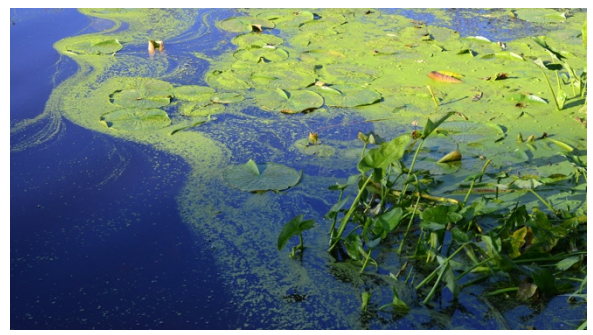
Figure 2. Lake with Algae

water can be determined and then factored into subsequent fluorescence sensor readings.