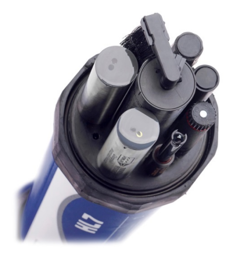
Figure 1. Integrated submersible fluorescence sensor - configured on a HYDROLAB® HL7 multiparameter water quality sonde

Phytoplankton are microscopic, free-floating photosynthetic plants and bacteria that are commonly found in surface waters throughout the world. Aquatic scientists and water resource managers measure phytoplankton to gain a more in depth understanding on ecological dynamics, ecological health, nutrient status, and harmful algal bloom potential in aquatic systems. Submersible fluorescence sensors help to make this measurement easy, efficient, and economical by enabling real-time field estimates of phytoplankton biomass that can be directly correlated to quantitative laboratory measurements using standard methods.